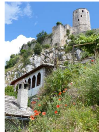
Pocitelj Ottoman Village (Bosnia)