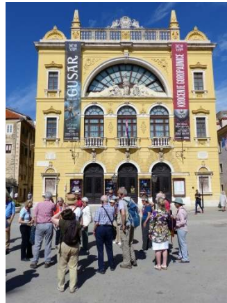
Opera House (Split)