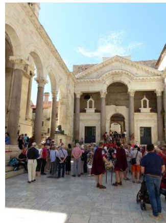
The Palace (Split)