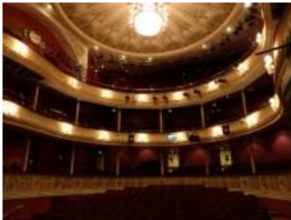
Interior burned in 1862 but rebuilt in only 9 months