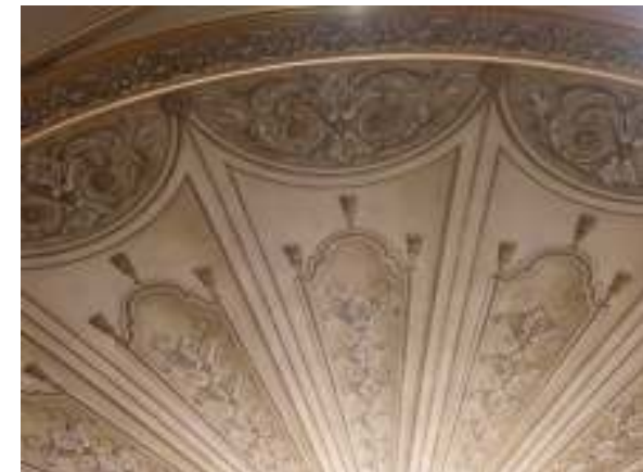
Intricate ceiling detail