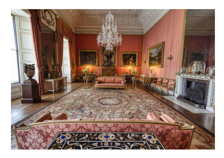
Shugborough House (The Red Drawing Room)

We will check out of the hotel after breakfast and travel by coach to The Whitworth . Founded in 1885 as part of the University of Manchester, it was re-opened in 2015 after a £15 million remodelling project which integrated the museum with its parkland setting. It boasts the widest range of textiles outside of the Victoria and Albert Museum in London and is home to a renowned collection of modern art, watercolours, textiles, sculptures, prints and wallpapers. We hope to arrange a